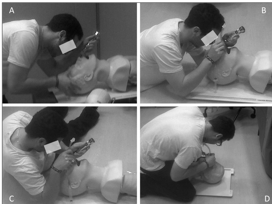
Fig. 2 The four clinical variations of endotracheal intubation used in our study design: a Normal b Supine c Left Lateral Decubitus d Straddling

We developed our three educational interventions using the proposed dimensions of SRL [20]: supervision (present or absent) and SRL-supports (present or absent). We chose to study three groups to increase the practical relevance of our research, given a fourth group (supervised, unsupported) would have been artificial (i.e., an instructor told to actively not support participants), and would likely have altered our results in favour of our hypotheses. We piloted and refined our approach for the three groups using three participants per group (data not collected during piloting).